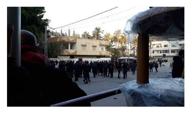
The Hamas security forces detain Fatah activists in the Gaza Strip (official Fatah Facebook page, March 17, 2019).