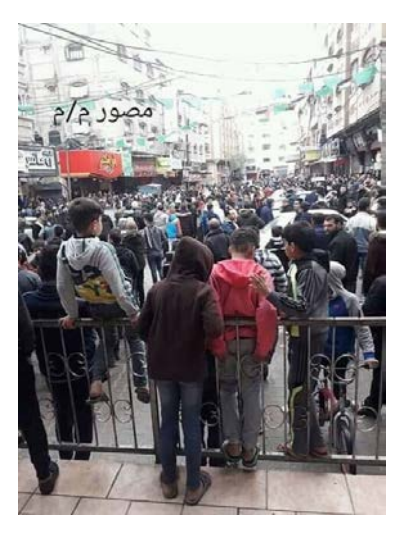
Demonstrations in Jabalia on March 14, 2019 (Bawabat al-Hadaf Twitter account, March 14, 2019).

• Deir al-Balah : A demonstration was held in Deir al-Balah to protest the cost of living and the rise in taxes. The security forces in the Gaza Strip fired shots into the air to disperse the demonstration (Shabakat Quds Twitter account, March 15, 2019). Eye witnesses reported that the security forces brought reinforcements to the area to suppress the demonstration. They destroyed houses and hurt residents (Wafa, March 15, 2019). According to reports, more than 20 policemen were injured in the clashes in Deir al-Balah when residents attacked them (Paldf, March 14, 2019).