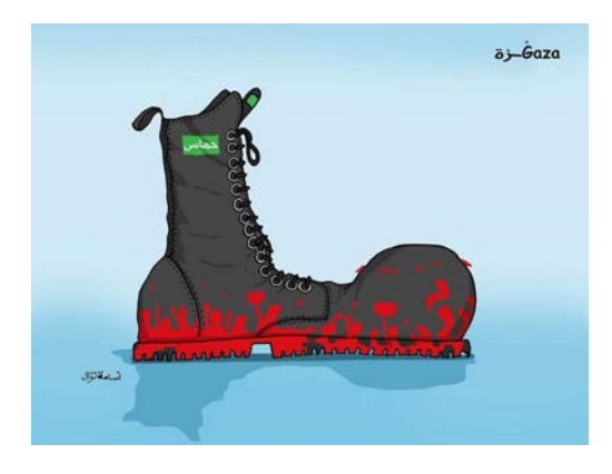
The ground under Hamas' feet is burning because of the protests against the high cost of living (official Fatah Facebook page, March 16, 2019).

Cartoons in the PA's al-Hayat al-Jadeeda following the suppression of the protests in the Gaza Strip. Right: The "Gaza Strip:" "I suppressed [the riots]...I was calm and secure...I went to sleep" (Saba'neh Facebook page, March 16, 2019). Left: The Hamas insignia, with the Dome of the Rock exchanged for the face of an operative of Hamas' internal security forces, and the swords exchanged for clubs (Saba'neh Facebook page, March 17, 2019).