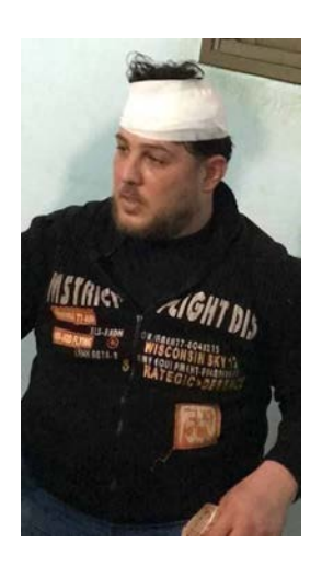
A demonstrator injured during the suppression of the demonstrations (Facebook page of journalist Usama al-Kahlut, who was detained by Hamas' security forces, March 14, 2019).