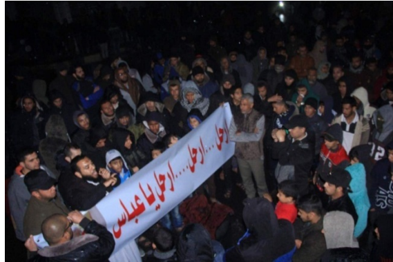
Demonstrations organized by Hamas against Mahmoud Abbas. Right: Demonstration in Nuseirat (central Gaza Strip). The banner reads, "Resign, resign [Mahmoud] Abbas" (Palinfo Twitter account, March 16, 2019). Left: Demonstration in Jabalia (Palinfo Twitter account, March 16, 2019).