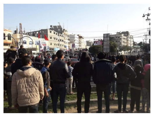
Demonstrations in Rafah on March 15, 2019 (msdrnews Facebook page, March 15, 2019).

• Khan Yunis (central Gaza Strip): Palestinians set fire to tires during a demonstration to protest their harsh living conditions (Shabakat Quds Twitter account, March 15, 2019). The security forces suppressed the demonstration. According to reports, operatives of the security forces arrived at the location armed with clubs and tasers. They fired shots into the air and injured a number of demonstrators (Wafa, March 15, 2019).