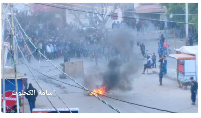
Demonstrations in Deir al-Balah (Facebook page of journalist Usama al-Kahlut, who was detained by Hamas' security forces, March 14, 2019).