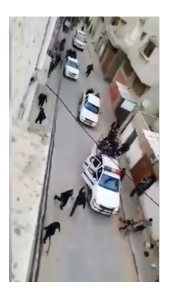
Security force operatives deploy to disperse demonstrations in Deir al-Balah (Facebook page of journalist Muhammad Uthman, March 14, 2019).